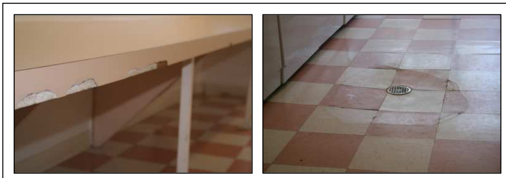
Prior to renovations, the Season's laundry rooms showed signs of disrepair common in many communities that contribute to the negative perception of central laundry in the industry.